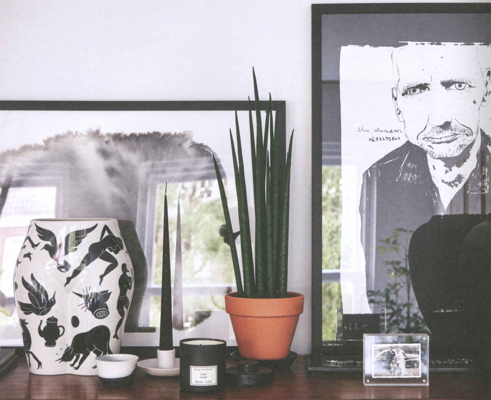
This page On the vintage cupboard Vaso di Culo vase by Parra for Case Studyo Page right Kitchen by Piet Boon Kitchen, tap from Piet Boon by Cocoon, soapdispenser by Piet Boon by Formani